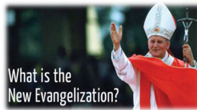
Blessed John Paul II

✧ the Church has identified that 21 st century learners require a distinctive approach to Religious Education using the approaches of the New Evangelization